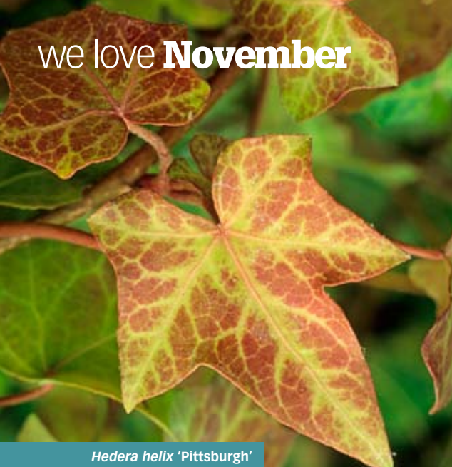
Hedera helix 'Pittsburgh'