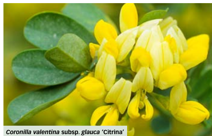
Coronilla valentina subsp. glauca 'Citrina'