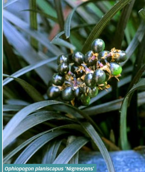
Ophiopogon planiscapus 'Nigrescens'

DETAILS Pansies are unfairly sneered at by plant snobs, but are indefatigably cheery and invaluable in winter • Sow seeds either in February or at any time from June to September • Height 15-20cm