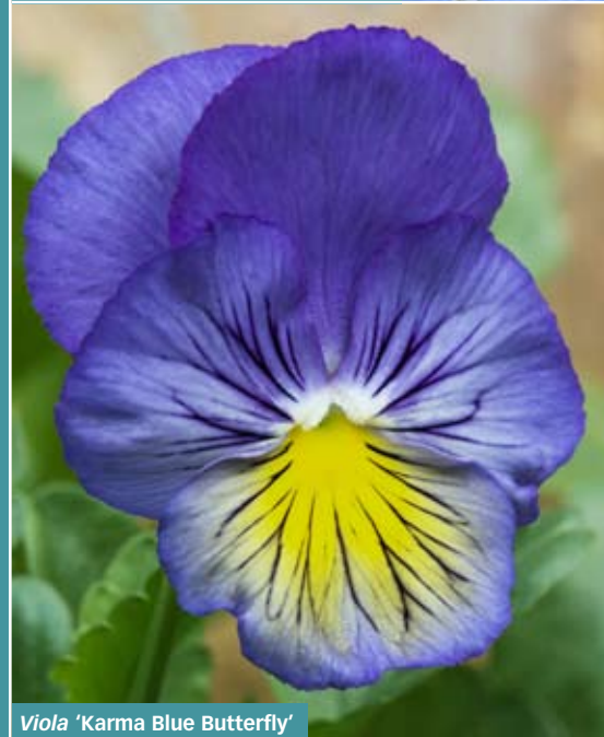
Viola 'Karma Blue Butterfly'