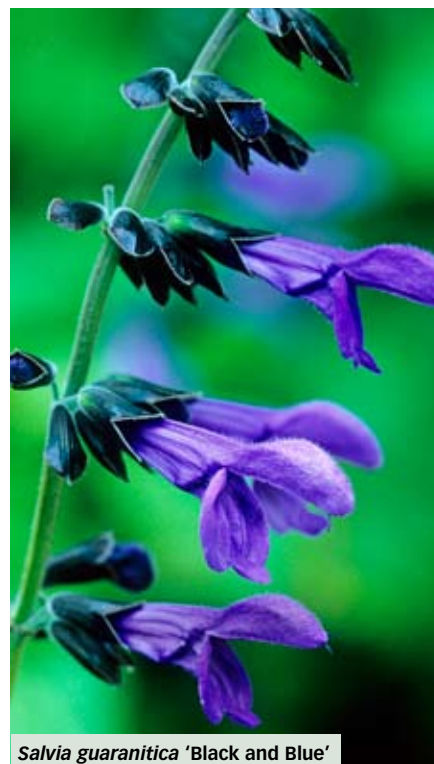
Salvia guaranitica 'Black and Blue'

DETAILS Can spread indefinitely, but is never a pest • Tolerates partial shade well • Must not get waterlogged in winter • Height 1m