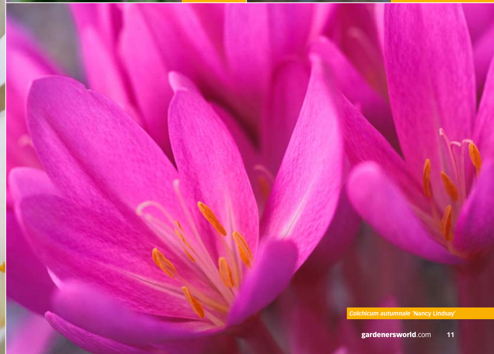
Colchicum autumnale 'Nancy Lindsay'