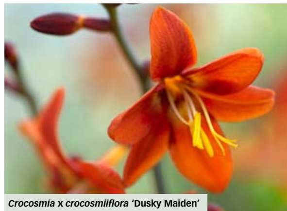
Crocosmia x crocosmiiflora 'Dusky Maiden'