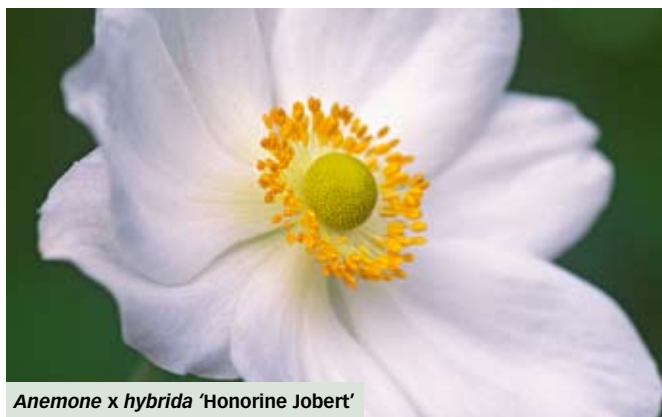
Anemone x hybrida 'Honorine Jobert'