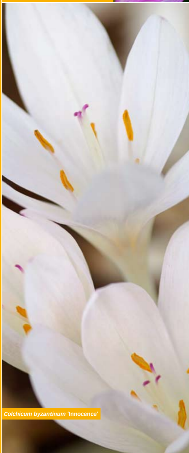
Colchicum byzantium 'Innocence'