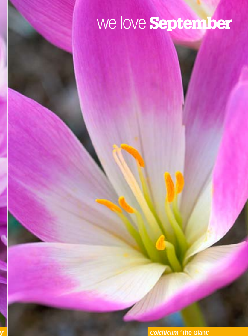
Colchicum 'The Giant'