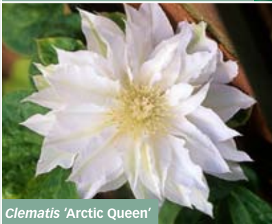
Clematis 'Arctic Queen'