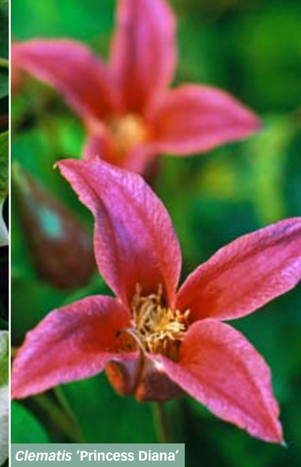
Clematis 'Princess Diana'