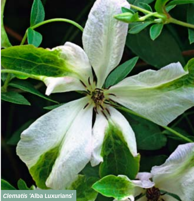
Clematis 'Alba Luxurians'

DETAILS An exuberant variety with hordes of small, slightly twisty flowers • Scented • Grow in good soil with some shade around the roots • Height 4m