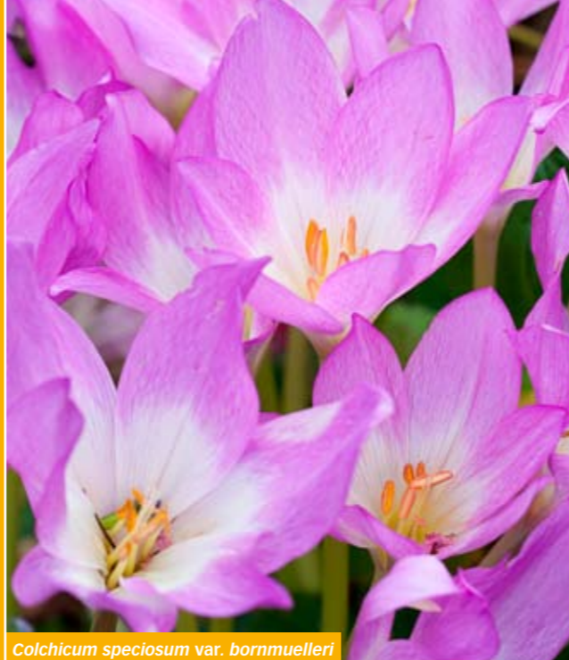
Colchicum speciosum var. bornmuelleri

DETAILS Plant under trees as they need to be as dry as possible during summer dormancy • Sow seed under glass in late winter • Height 12cm