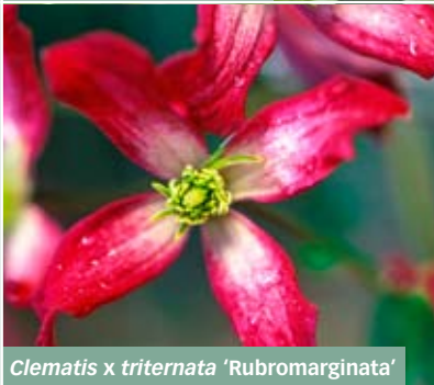
Clematis x triternata 'Rubromarginata'