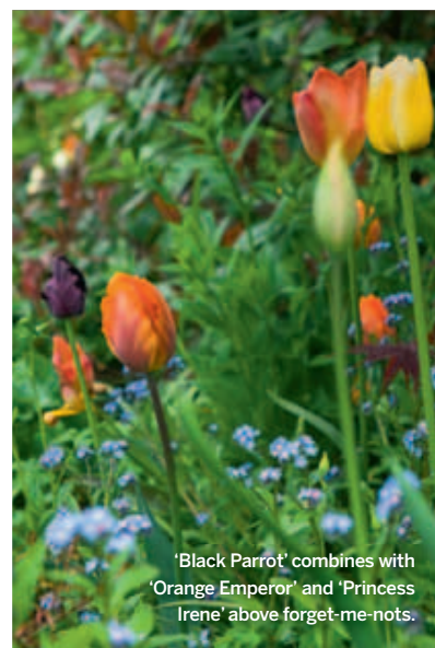
'Black Parrot' combines with 'Orange Emperor' and 'Princess Irene' above forget-me-nots.