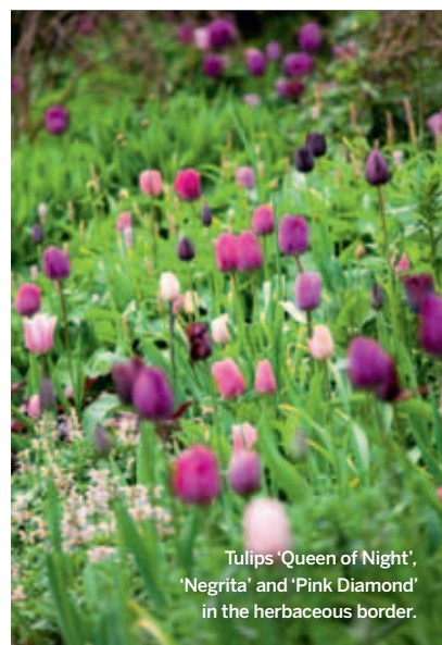
Tulips 'Queen of Night', 'Negrita' and 'Pink Diamond' in the herbaceous border.