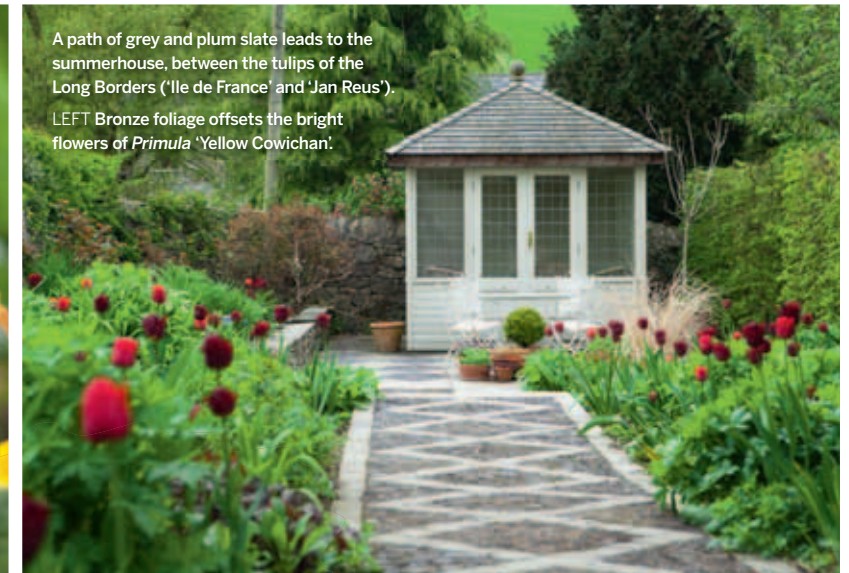
A path of grey and plum slate leads to the summerhouse, between the tulips of the Long Borders ('Ile de France' and 'Jan Reus'). LEFT Bronze foliage offsets the bright flowers of Primula 'Yellow Cowichan'.