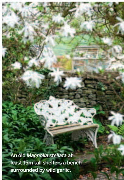
An old Magnolia stellata at least 15m tall shelters a bench surrounded by wild garlic.