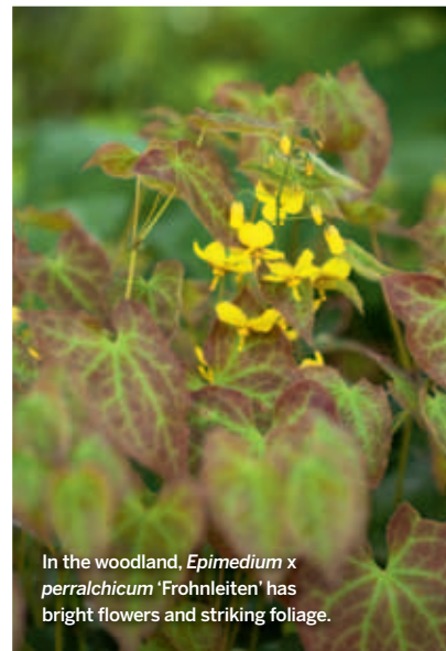
In the woodland, Epimedium x perralchicum 'Frohnleiten' has bright flowers and striking foliage.