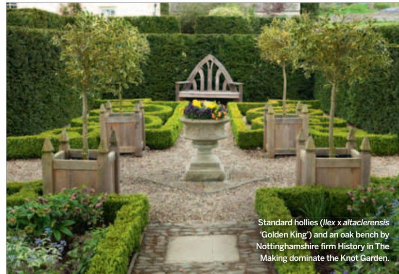
Standard hollies ( Ilex x altaclerensis 'Golden King') and an oak bench by Nottinghamshire firm History in The Making dominate the Knot Garden.

From the front door there is a long herbaceous border – packed with tulips at this time of year – backed against the old stone wall. Parallel to this a wide path dives between two ancient Irish yews to emerge by a natural pond beneath a twisted