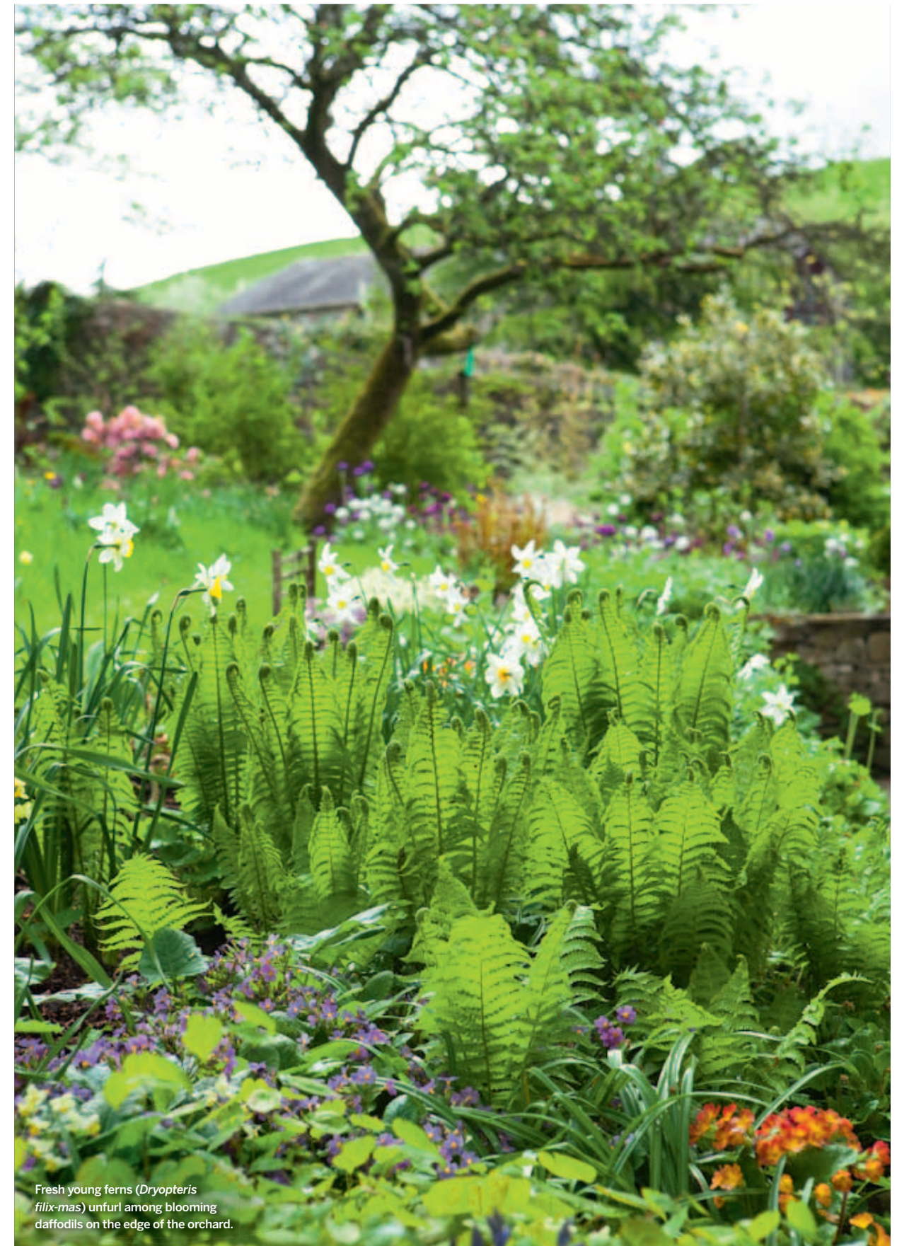
Fresh young ferns ( Dryopteris filix-mas ) unfurl among blooming daffodils on the edge of the orchard.