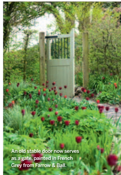
An old stable door now serves as a gate, painted in French Grey from Farrow & Ball.

▷ (pictured on page 35), two more ponds and down through an exotic garden (excellent in late summer), with bamboo, gunnera, dahlias and a coppiced Paulownia tomentosa ) before you return to the house. Phew.