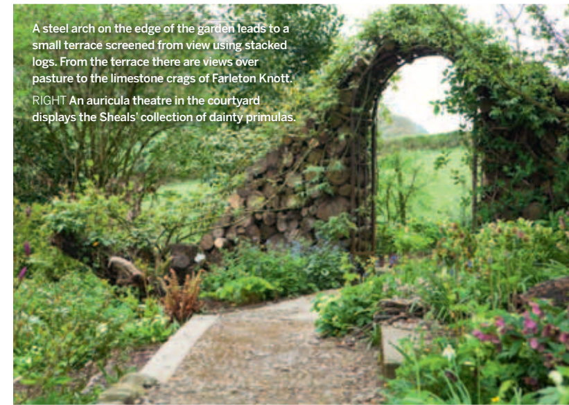
A steel arch on the edge of the garden leads to a small terrace screened from view using stacked logs. From the terrace there are views over pasture to the limestone crags of Farleton Knott. RIGHT An auricula theatre in the courtyard displays the Sheals' collection of dainty primulas.

At the top of the hill you emerge on to a path leading to another summer house ▶