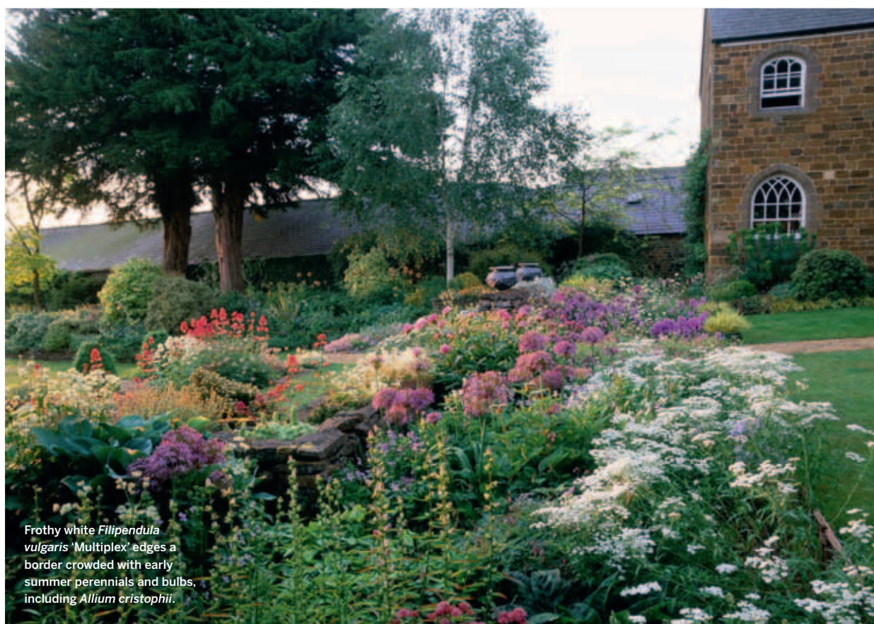
Frothy white Filipendula vulgaris 'Multiplex' edges a border crowded with early summer perennials and bulbs, including Allium cristophii .

We see many gardens on these pages: some old, some modern, some grand, some humble. Almost all are beautiful, but the ones that keep drawing you back are the gardens where you can see the passion: these are the gardens that one will remember for ever.