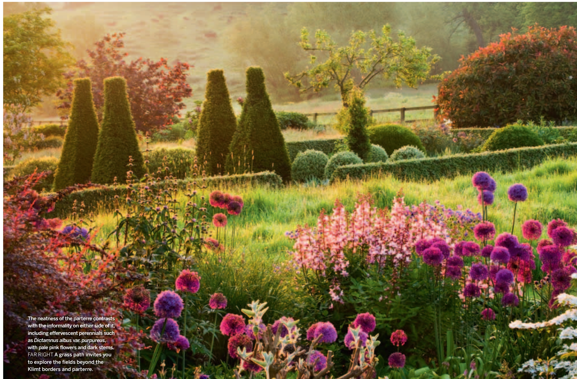
The neatness of the parterre contrasts with the informality on either side of it, including effervescent perennials such as Dictamnus albus var. purpureus , with pale pink flowers and dark stems. FAR RIGHT A grass path invites you to explore the fields beyond the Klimt borders and parterre.